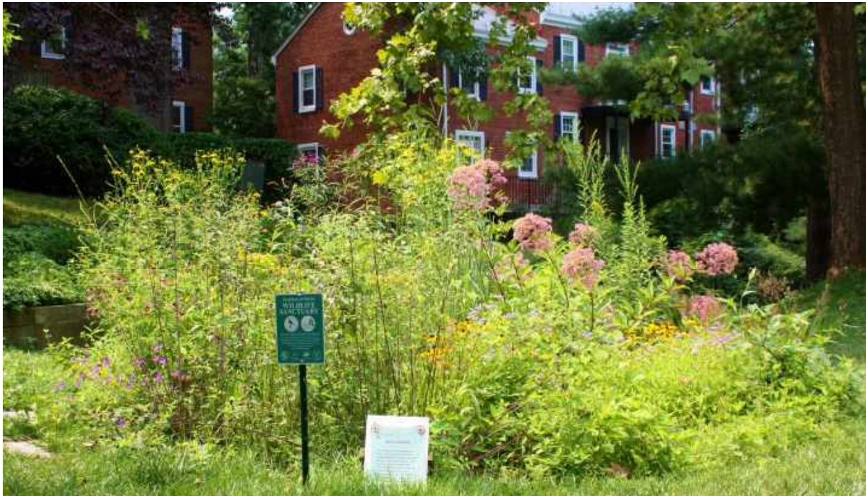
Grand Canyon” Rain Garden #1 4836 S. 29 th Street