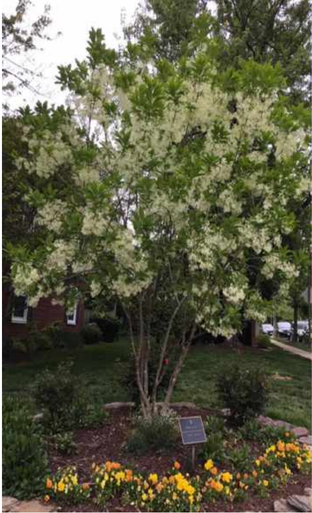
Fringe tree ( Chionanthus virginicus ) Corner of South Abingdon and 31 st Street