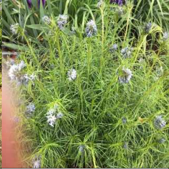
Blue star amsonia ( Amsonia ) Corner of South Buchanan and 31 st Street