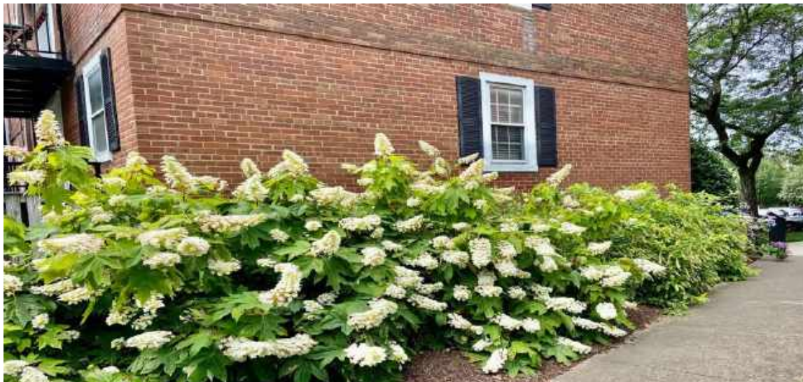
Oak Leaf hydrangea ( Hydrangea quercifolia ) as a native border 2873 S. Buchanan Street