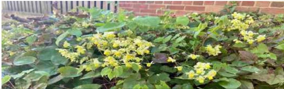
Barren wort ( Epimedium ) 2987 S. Columbus Street