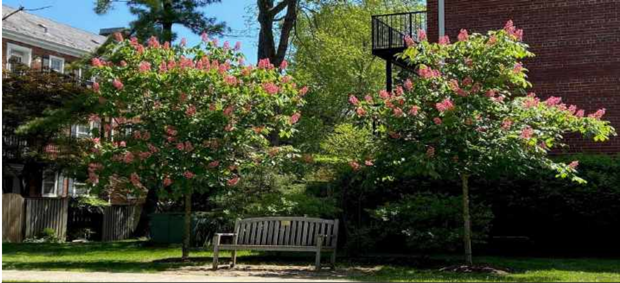
Native Red Horse Chestnut ( Aesculus carnea ) trees At the Tom Burke and Roger Lowe Memorial Bench located next to 3047 South Buchanan Street.