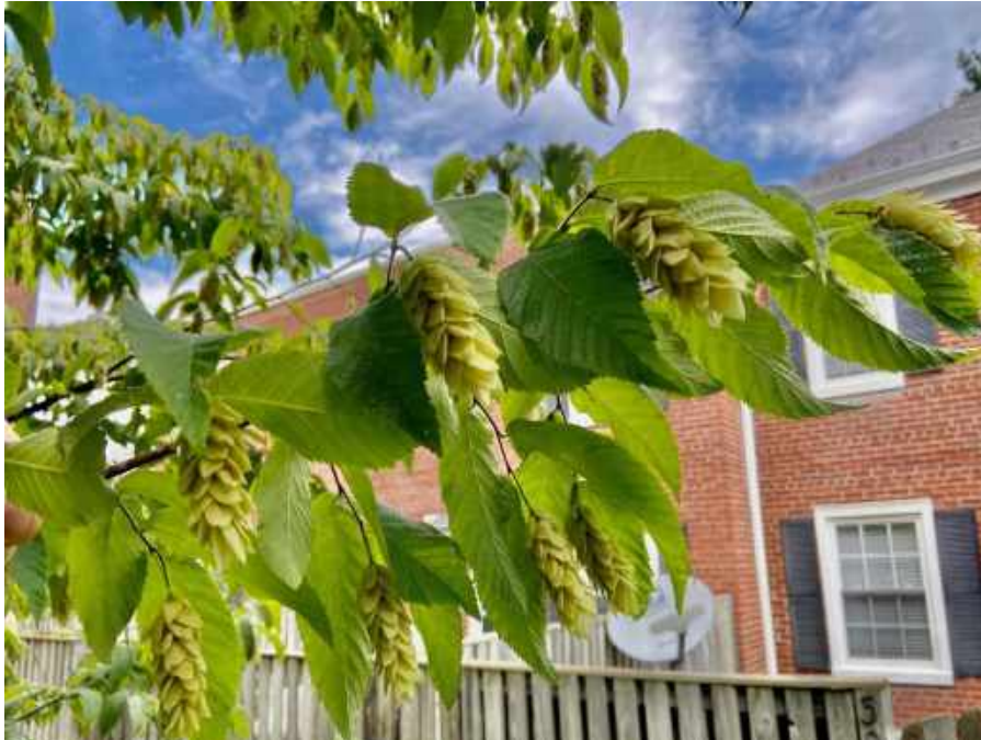
Native Hop Hornbeam ( Ostrya virginiana ) Tree 3066 S. Woodrow Street