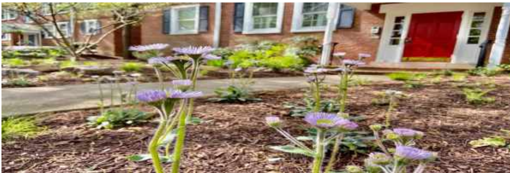
Columbus Street native plants shade garden pilot with purple asters ( Symphyotrichum patens ) 2934 S. Columbus Street (2019)