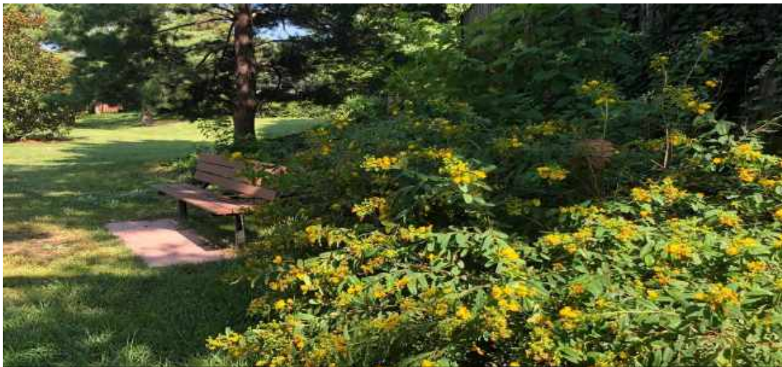
Perforate St John's Wort ( Hypericum ) 3052 S. Abingdon Street