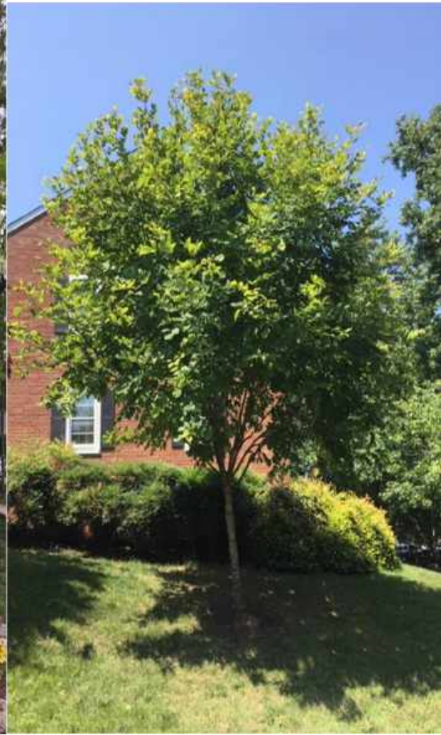
Native Yellowwood Tree ( Cladrastis kentukea ) Lot #5 2838-2826 South Abingdon Street