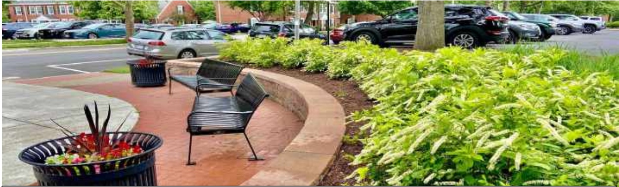
Virginia sweetspire ( Itea ) bordering the area near 3039 S. Abingdon Street