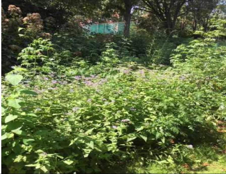
Rain Garden # 6 Behind 4821 South 31 st Street