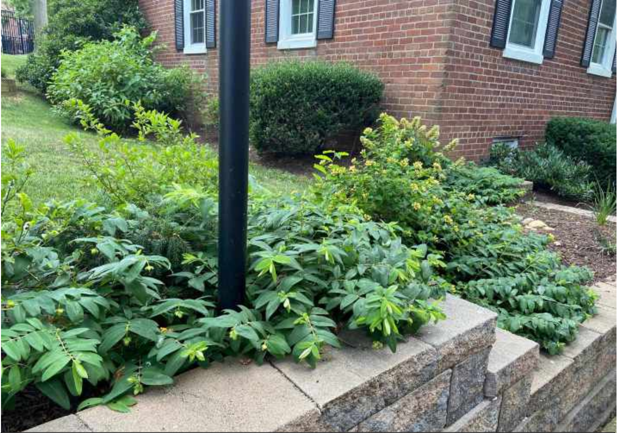
Hypericum as a border 4858 S. 28 th Street