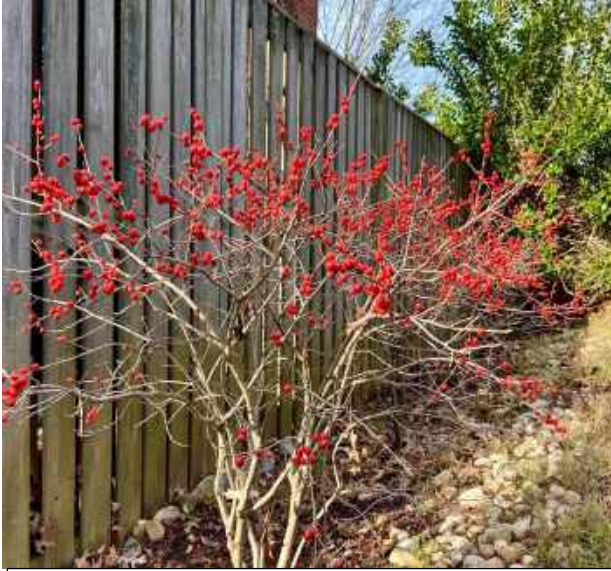
Winterberry holly ( Ilex verticillate ) in winter along the back fence at 4858 South 28 th Street