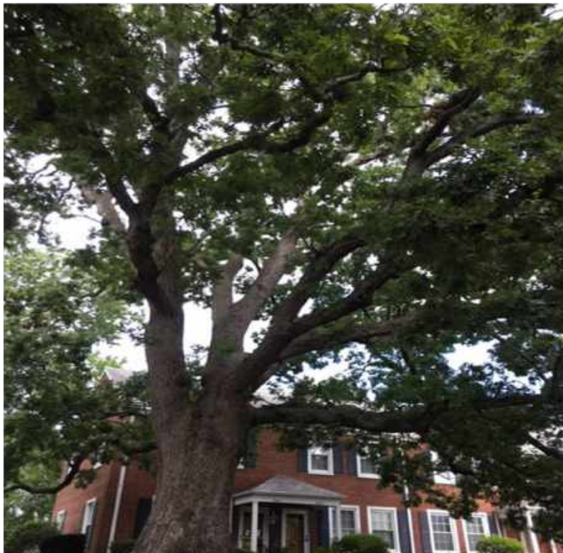
Arlington County 2015 Champion White Oak Tree (Quercus alba) 3059 South Abingdon Street