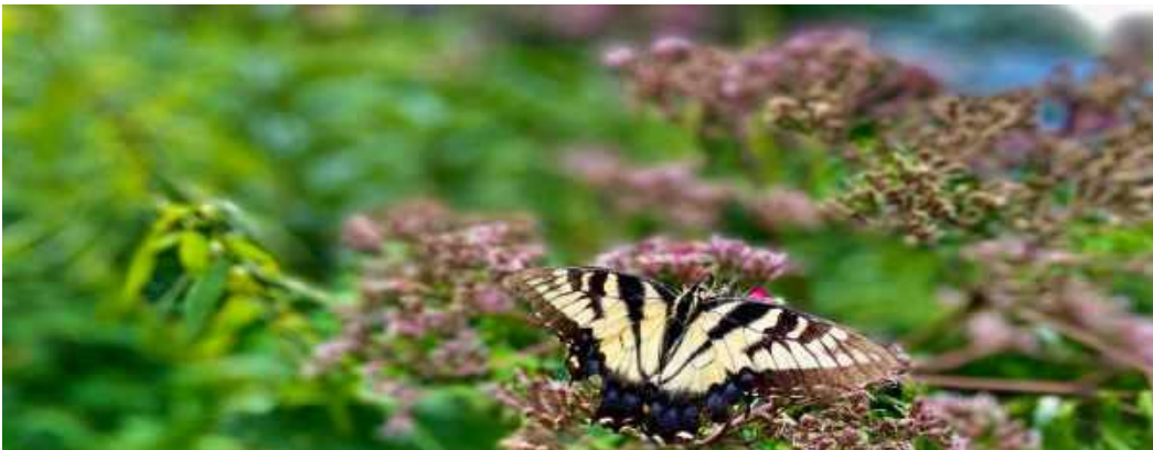
Swallowtail butterfly on Joe Pye Weed ( Eutrochium purpureum ) 2931 S. Dinwiddie Street (hillside)