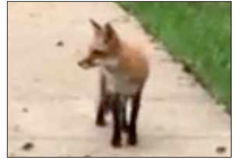
A foxy Fairlingtonian out for a stroll.

Under normal circumstances, coexistence will result in few interactions between animals and people. For the most part, humans are diurnal (up and about during the day) while our wild neighbors are primarily nocturnal. Virginia law prohibits feeding wildlife to avoid habituation, in other words, making animals dependent on food provided by humans rather than prey it hunts on its own.