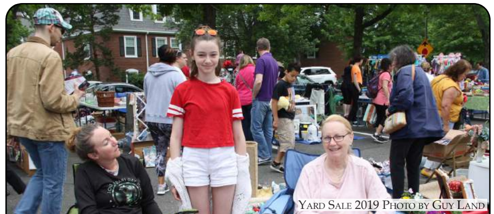
YARD SALE 2019