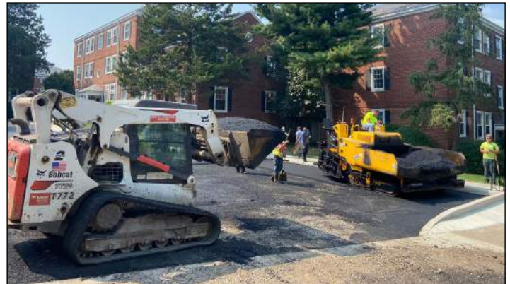
Parking lot 47 underwent renovations in September.

In April, parking lot 7 (2833-2861 S. Buchanan St.) was renovated. In September, parking lot 47 (2870-2880 S. Abingdon St.) and 58 (3066-3082 S. Abingdon St.) were completed, followed by renovation of parking lot 34 (4828-4836 S. 29th St. ), 53 (4652-4654 S. 31st St. ), and 41 (2875-2895 S. Abingdon St.).