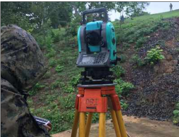
Surveyors from Dominion Surveyors use technical equipment to determine the boundaries of the Association's lot.

Dominion Surveyors, Inc., is working to set the corners of the Association's lot and establish set points to indicate the Association's property line. You may have seen them in action on the property in February. Upon completion, the Association will have an updated plat with its boundaries clearly marked that will assist in planning future replacement reserve projects.