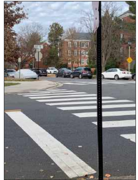
Example of a stop bar at the intersection of Abingdon Street and 29th Street.