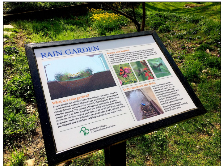
A Rain Garden is one example of how the Association is increasing flood resilience.