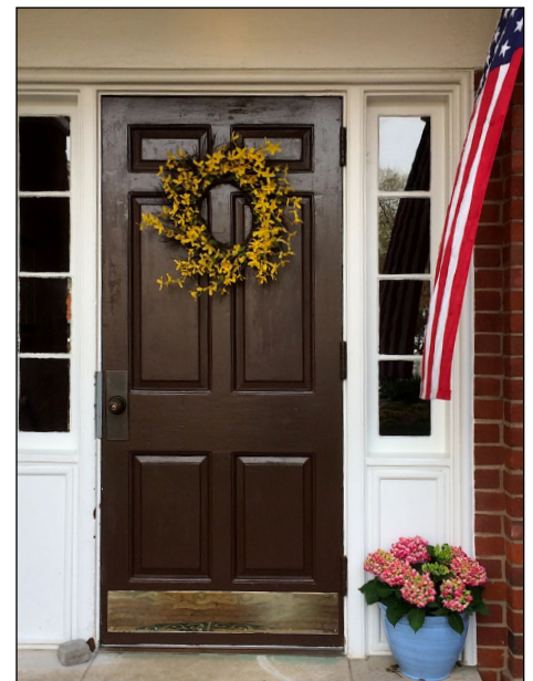
Opening the door to Halloween.

If you can volunteer to help with this fun event, please email the Activities Committee at activities@fairlingtonvillages.com .