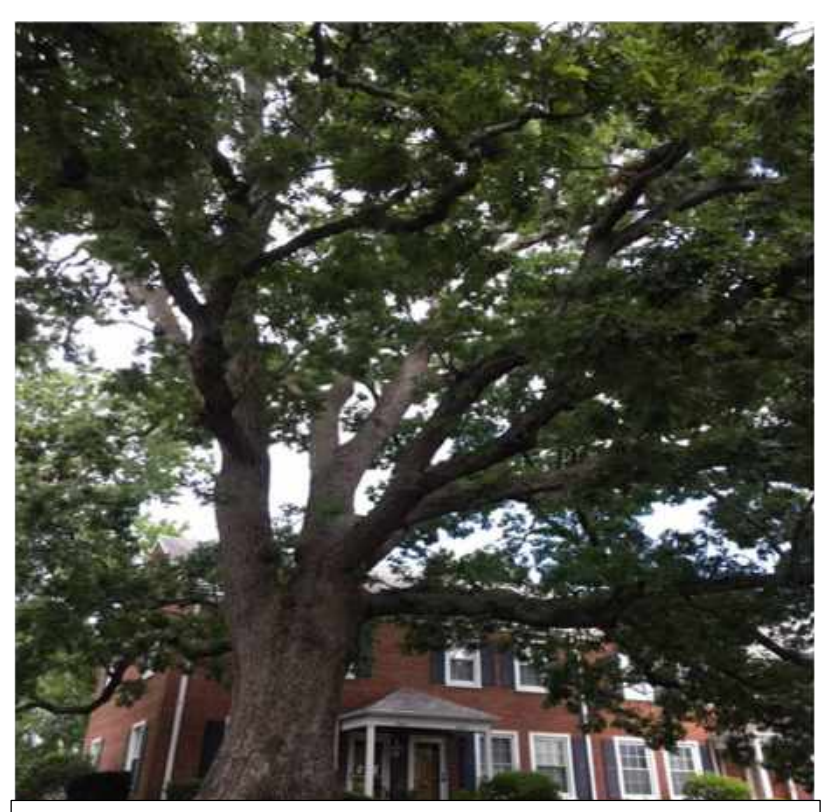
Arlington County 2015 Champion White Oak Tree (Quercus alba) 3059 South Abingdon Street