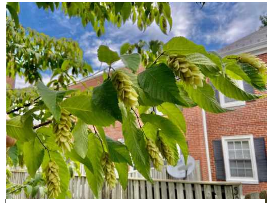
Native Hop Hornbeam ( Ostrya virginiana ) Tree 3066 S. Woodrow Street