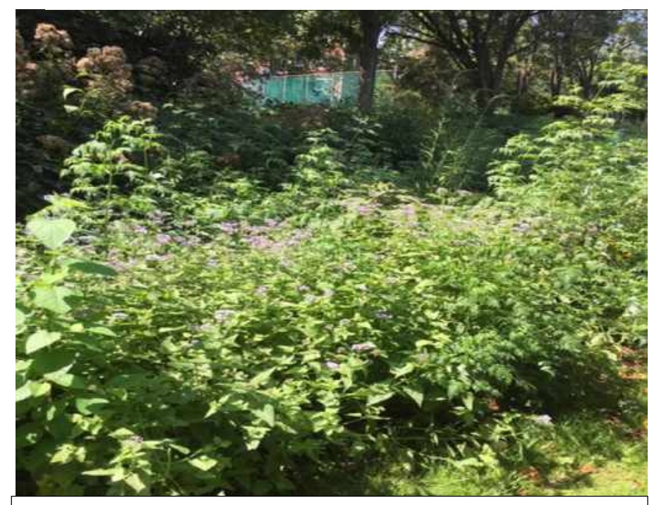
Rain Garden # 6 Behind 4821 South 31<sup>st</sup> Street