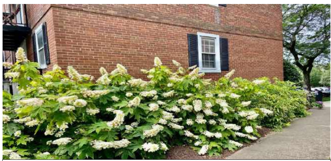
Oak Leaf hydrangea ( Hydrangea quercifolia ) as a native border 2873 S. Buchanan Street