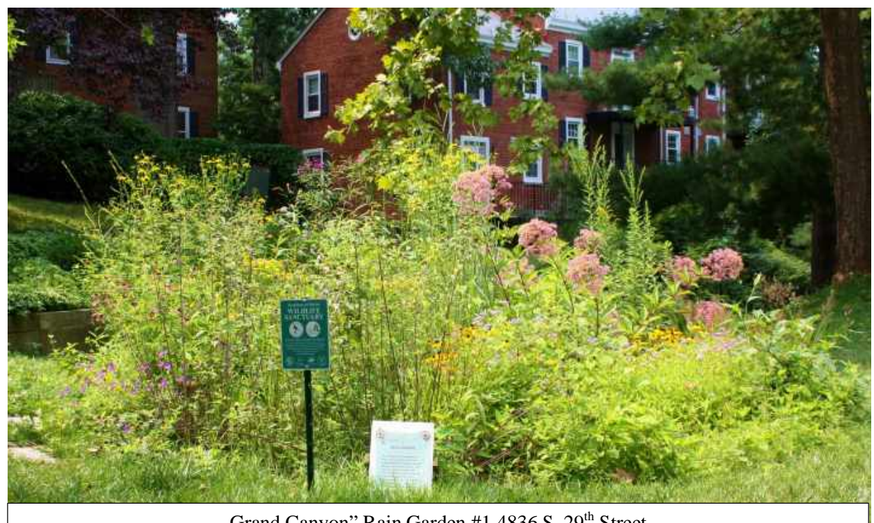
Grand Canyon" Rain Garden #1 4836 S. 29th Street