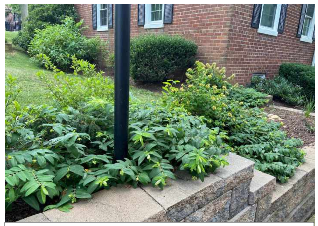
Hypericum as a border 4858 S. 28<sup>th</sup> Street