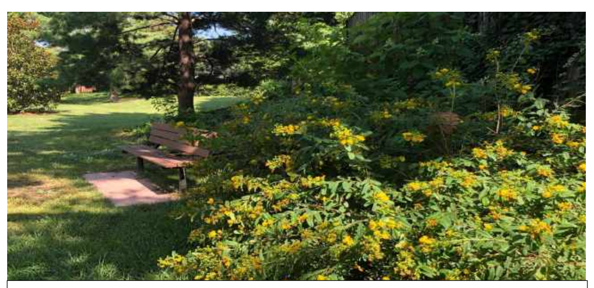
Perforate St John's Wort ( Hypericum ) 3052 S. Abingdon Street