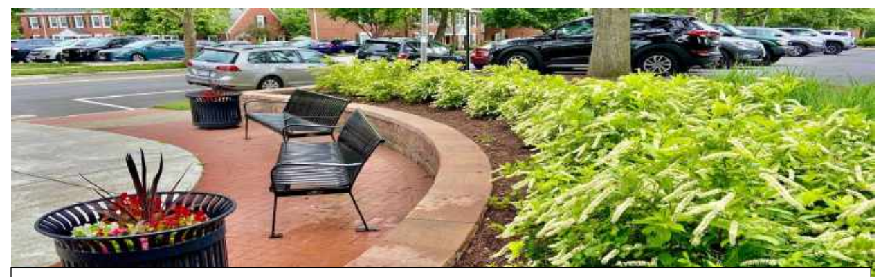
Virginia sweetspire (Itea) bordering the area near 3039 S. Abingdon Street