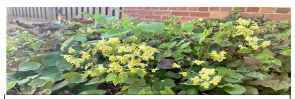
Barren wort ( Epimedium ) 2987 S. Columbus Street