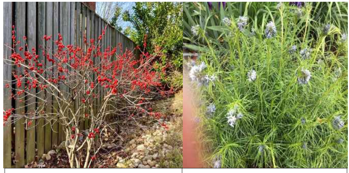
Winterberry holly ( Ilex verticillate ) in winter along the back fence at 4858 South 28<sup>th</sup> Street