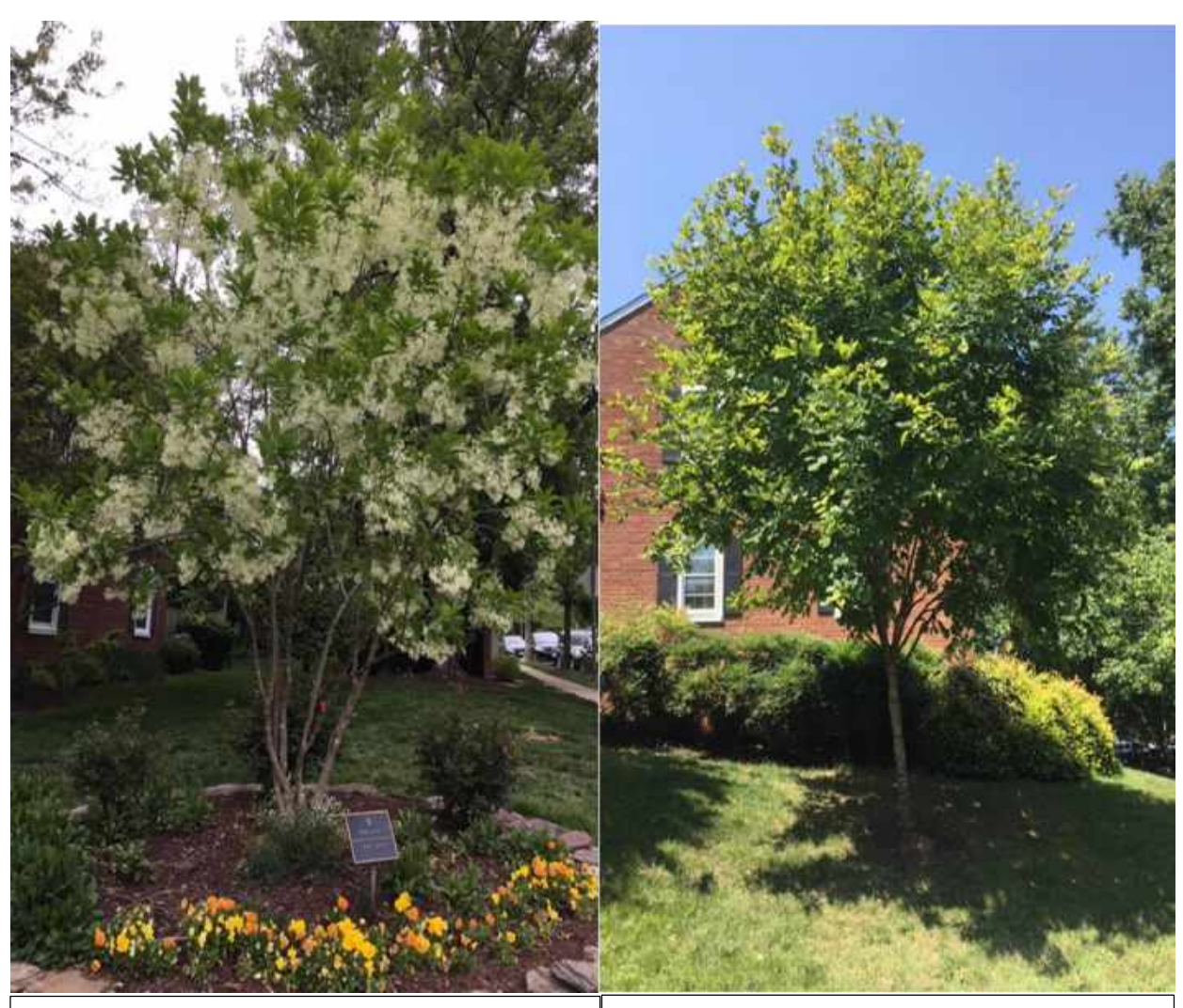
Fringe tree ( Chionanthus virginicus ) Corner of South Abingdon and 31<sup>st</sup> Street