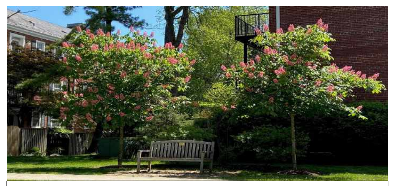
Native Red Horse Chestnut ( Aesculus carnea ) trees At the Tom Burke and Roger Lowe Memorial Bench located next to 3047 South Buchanan Street.