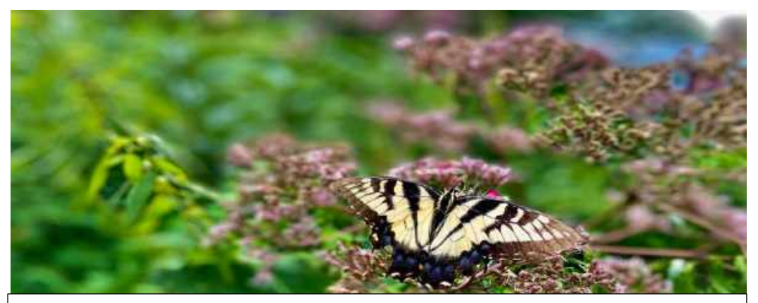
Swallowtail butterfly on Joe Pye Weed ( Eutrochium purpureum ) 2931 S. Dinwiddie Street (hillside)