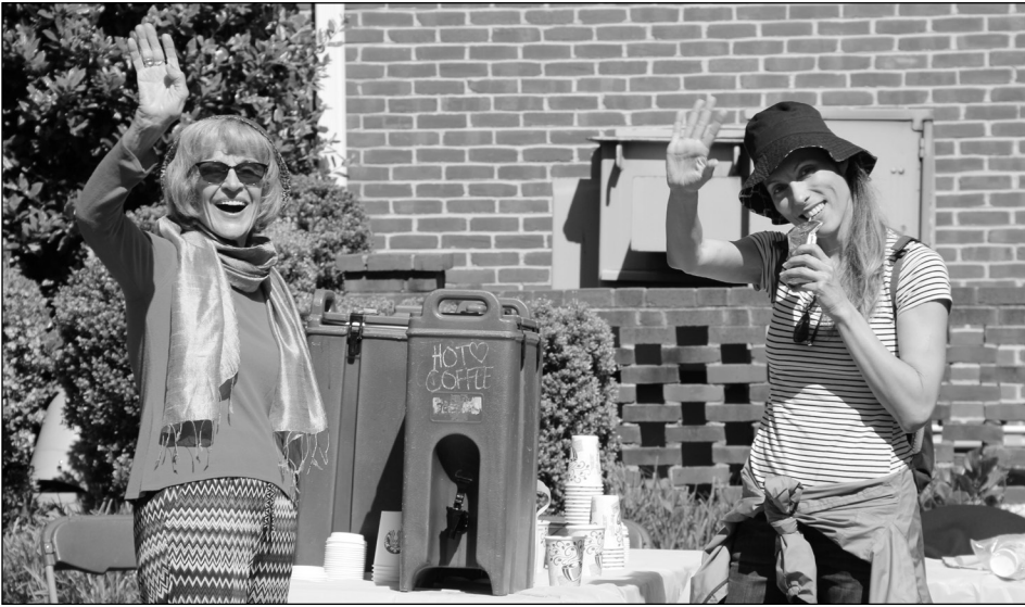
VINTAGE 2023 PHOTO BY GUY LAND

The Spring Yard & Plant Sale relies on volunteers like these happy helpers last year.