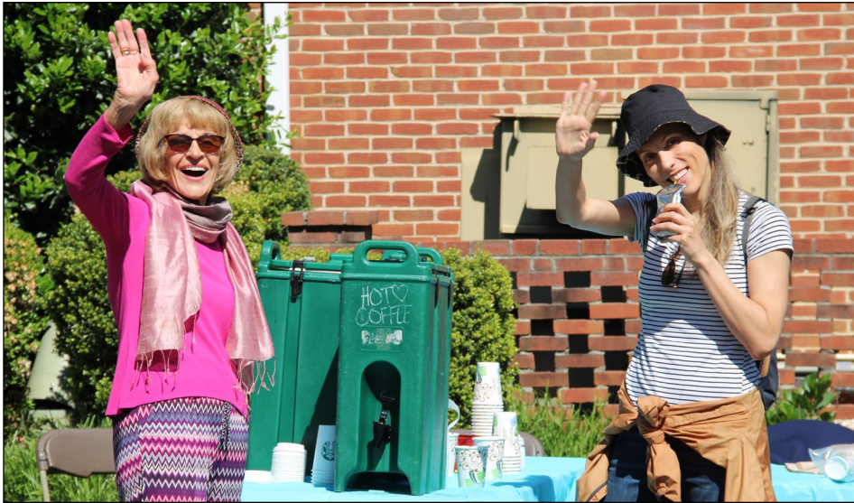
VINTAGE 2023

The Spring Yard & Plant Sale relies on volunteers like these happy helpers last year.