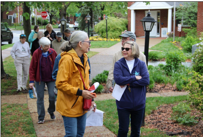
VINTAGE 2023

Last year, the Spring Walk-Through 2023 included Fairlingtonians and invited guests traversing the grounds.