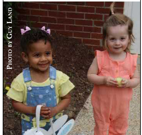
Young Fairlingtonians enjoyed the Easter Egg Hunt; learn more on page 4.