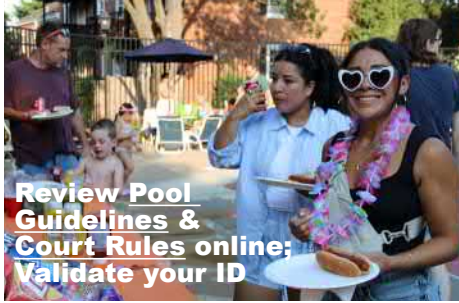
Review Pool Guidelines & Court Rules online; Validate your ID

All activities are held at our Fairlington Villages Community Center, 3005 S. Abingdon St. in Arlington, unless noted otherwise. If you need more details on any activity listed here, connect via TownSq or contact the Management Office via email or call 703-379-1440.