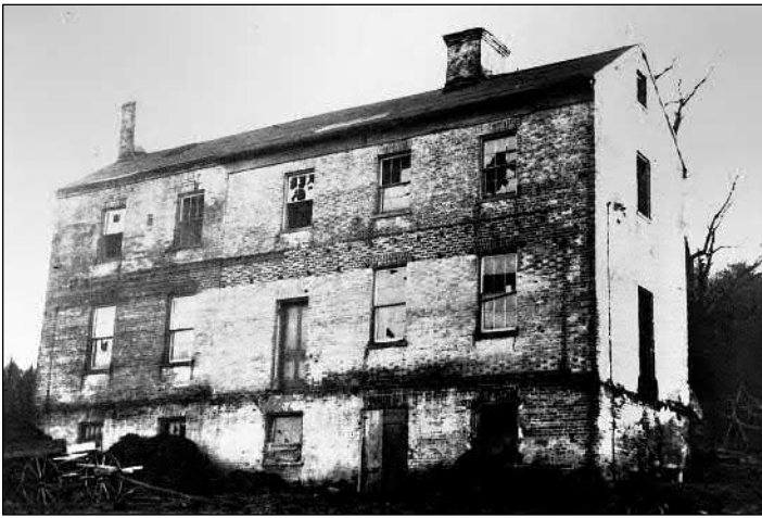
Historic photograph of the Torthorwald plantation house prior to demolition for Fairlington's development.