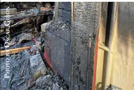
Checking in on the Maintenance Shop fire after one year, see page 3.